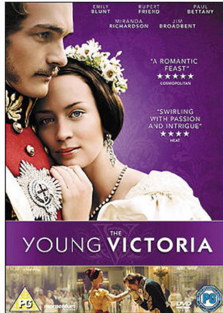
Emily Blunt ... The Young Victoria

By applying for an appointment for hair extensions using the prizewinner voucher you are deemed to have read, understood and accepted these terms and conditions and be bound by them. You must send us this original prizewinner voucher before an appointment can be scheduled and confirmed. Photocopies will not be accepted. Willow Hair accepts no liability for originals lost in the post. Hair extension appointment's are subject to availability. The appointment will be booked with selected stylists only. Appointments made with the prizewinner voucher will exclude Saturday's, Sunday's and late nights.